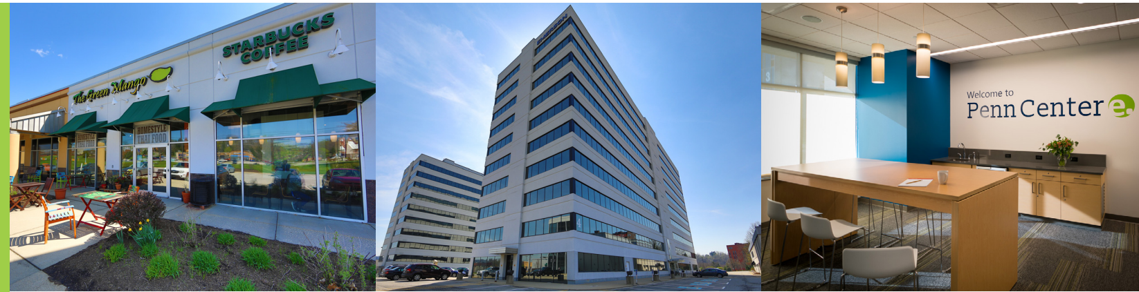
400 PENN CENTER BLVD, PITTSBURGH PA 15235